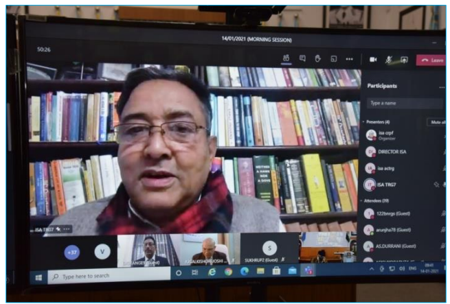
Sh. M. L. Kumawat, Ex-DG, BSF, in an online indoor session on The concept of Internal Security/Systems approach to Law and Order and Internal Security.