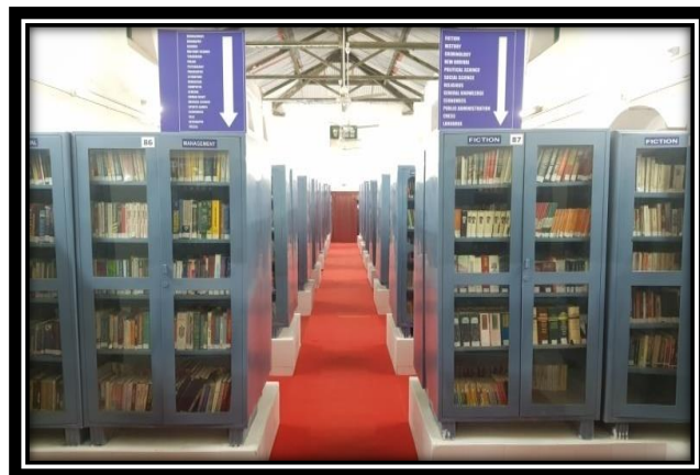
Knowledge Bank – “The library”