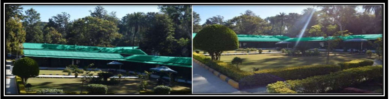
The trainee's abode – "Officers' Mess, Participants'

The participants will be accommodated in the Participant's Hostel only. Participants are advised to strictly adhere to the appropriate dress code in the Officers' Mess. No Participant will be permitted to stay out of the camp, in hotels etc. without prior approval.