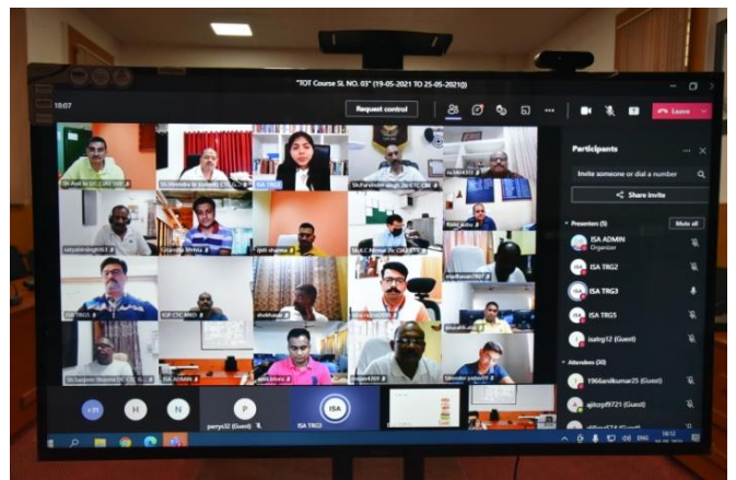
Officers attending class online from various parts of country .