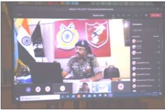
Sh. Prakash D, IPS, IG, CG, Sector, CRPF, in online indoor session on The concept of Internal Security/Systems approach to Law and Order and Internal Security