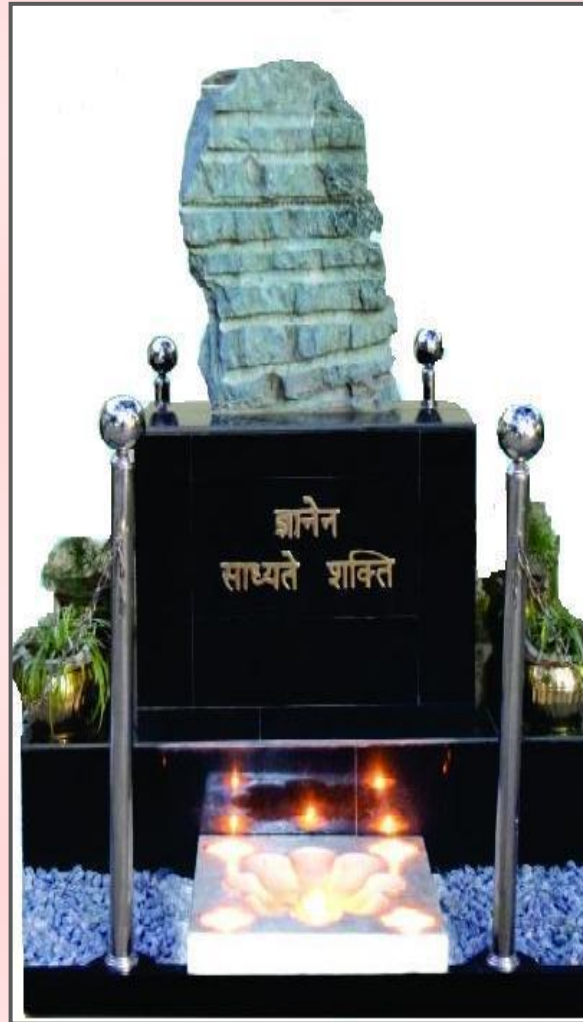
Centre of Excellence

The primary mission of the Internal Security Academy is to orient/re-orient officers of the CRPF/CPMF/State Police forces to carry out their assigned tasks and responsibilities with right attitude, uprightness, dedication and with a strong commitment of service to the people. The Academy aims at quality training with total quality management of the Institution. The Academy is a "Centre of Excellence" for training and research in various fields.