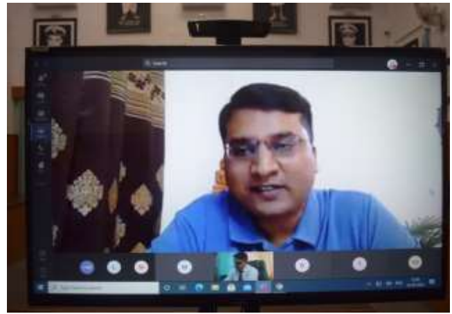
Sh. Nishant Jain IAS in an online session on Work-Life balance .