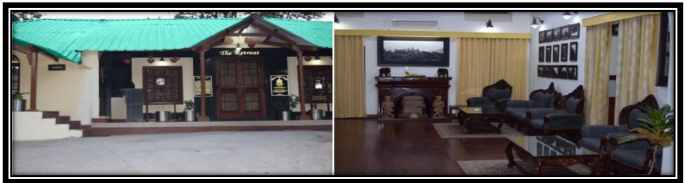
Officer's Mess-“The Retreat”

The participants will be accommodated in the Participant's Hostel. The Officers are not permitted to bring their family. However, they may do so at their own arrangement with prior approval of the Director ISA and with the condition that it will not hamper the training and its schedule. It will also not be possible to provide any type of services to those staying out of the campus. Participants are advised to strictly adhere to the proper dress code in the Officer's Mess. In case, any participant wants to stay out of the camp, in hotel etc, he can do so but entirely at his own risk and arrangements.