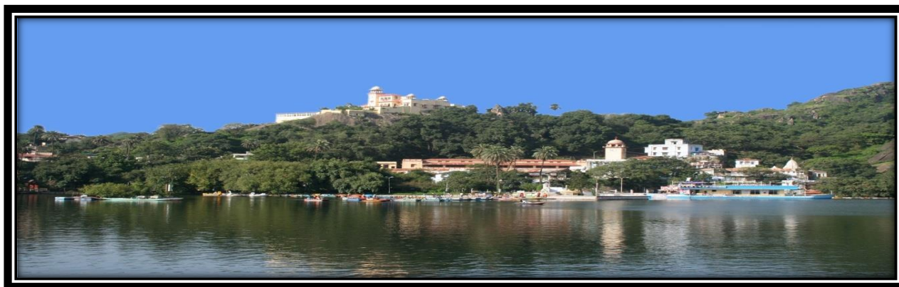
Panoramic view of Nakki-lake

average height of about 1220 meters above sea level. The mountain forms a distinct rocky plateau 22 km long by 9 km wide. The highest peak of Aravalli range is Guru Shikhar , at 1722 meters above sea level which is around 12 Kms from Mt. Abu. Mount Abu is referred to as ' an oasis in the desert ', as its heights are home to rivers, lakes, waterfalls and evergreen forests. The ancient name of Mount Abu is " Arbudaanchal ". It is also one of the major pilgrimage sites of India for both Hindu as well as Jain religions. Besides the temples and sites of historical importance, Mt. Abu is also rich in natural scenic beauty.