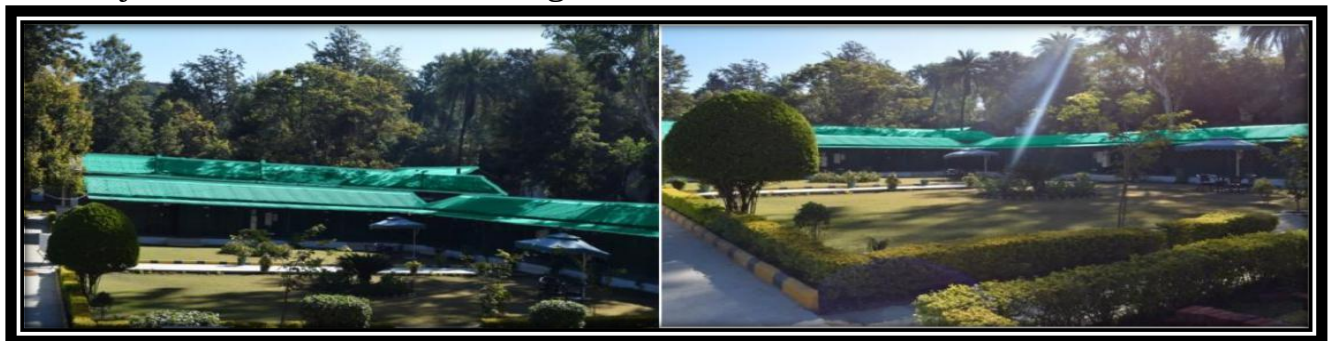
The trainee's abode – “Participant's Hostel”

The participants will be accommodated in the Participant's Hostel. The Officers are not permitted to bring their family. However, they may do so at their own arrangement with prior approval of the Director ISA and with the condition that it will not hamper the training and its schedule. It will also not be possible to provide any type of services to those staying out of the campus. Participants are advised to strictly adhere to the proper dress code in the Officer's Mess. In case, any participant wants to stay out of the camp, in hotel etc, he can do so but entirely at his own risk and arrangements.