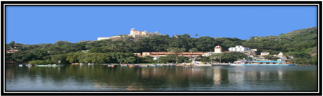
Panoramic view of Nakki-lake

The town is located in approx. 25 Sq.Kms. As per 2011 India census, Mount Abu has a population of 24,982. Male constitute 58% of the population and female 42%. Mount Abu has an average literacy rate of 67%.