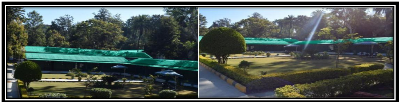
The trainee's abode – “Participant's Hostel”

The participants will be accommodated in the Participant's Hostel. The Officers are not permitted to bring their family. However, they may do so at their own arrangement with prior approval of the Director ISA and with the condition that it will not hamper the training and its schedule. It will also not be possible to provide any type of services to those staying out of the campus. Participants are advised to strictly adhere to the proper dress code in the Officer's Mess. In case, any participant wants to stay out of the camp, in hotel etc, he can do so but entirely at his own risk and arrangements.