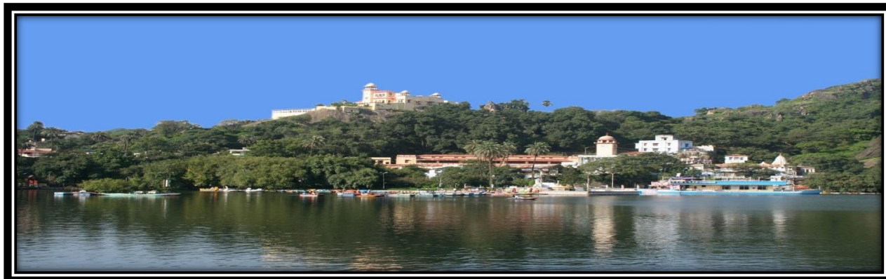
Panoramic view of Nakki-lake

on Aravalli Range of Rajasthan, one of the world's oldest mountain ranges, at an average height of about 1220 meters above sea level. The mountain forms a distinct rocky plateau 22 km long by 9 km wide. The highest peak of Aravalli range is Guru Shikhar , at 1722 meters above sea level which is around 12 Kms from Mt. Abu. Mount Abu is referred to as ' an oasis in the desert ', as its heights are home to rivers, lakes, waterfalls and evergreen forests. The ancient name of Mount Abu is " Arbudaanchal ". It is also one of the major pilgrimage sites of India for both Hindu as well as Jain religions. Besides the temples and sites of historical importance, Mt. Abu is also rich in natural scenic beauty.