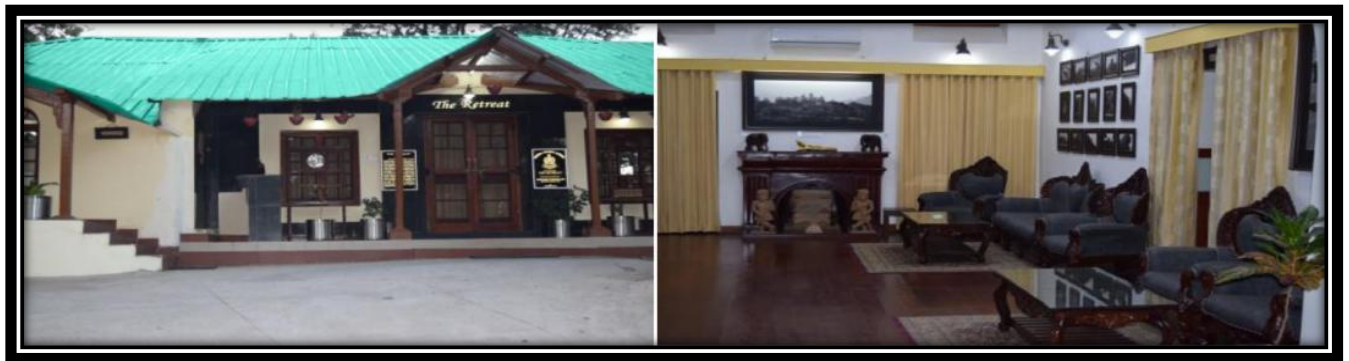
Officer's Mess-“The Retreat”

The participants will be accommodated in the Participant's Hostel. The Officers are not permitted to bring their family. However, they may do so at their own arrangement with prior approval of the Director ISA and with the condition that it will not hamper the training and its schedule. It will also not be possible to provide any type of services to those staying out of the campus. Participants are advised to strictly adhere to the proper dress code in the Officer's Mess. In case, any participant wants to stay out of the camp, in hotel etc, he can do so but entirely at his own risk and arrangements.