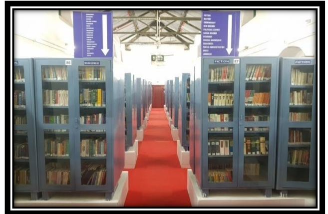
Knowledge Bank – “The library”