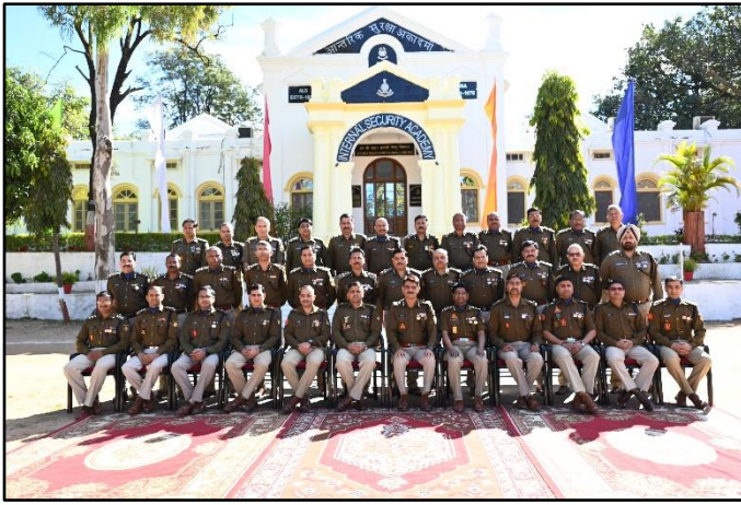
Group photograph of course participants with the faculty officers of ISA.