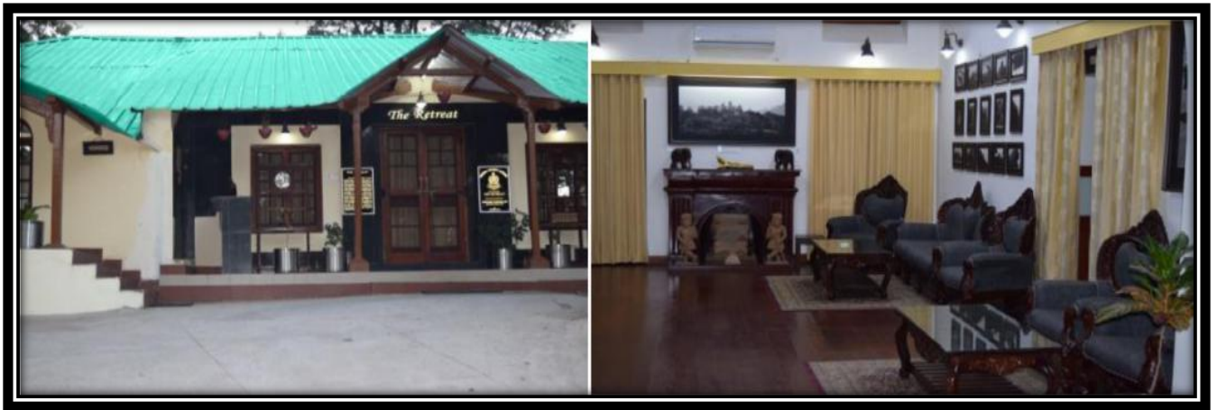
Officer's Mess-“The Retreat”

The participants will be accommodated in the Participant's Hostel. The Officers are not permitted to bring their family. However, they may do so at their own arrangement with prior approval of the Director ISA and with the condition that it will not hamper the training and its schedule. It will also not be possible to provide any type of services to those staying out of the campus. Participants are advised to strictly adhere to the proper dress code in the Officer's Mess. In case, any participant wants to stay out of the camp, in hotel etc, he can do so but entirely at his own risk and arrangements.