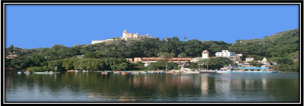
Panoramic view of Nakki lake

referred to as ' an oasis in the desert ', as its heights are home to rivers, lakes, waterfalls and evergreen forests. The ancient name of Mount Abu is " Arbudaanchal ". It is also one of the major pilgrimage sites of India for both Hindu as well as Jains. Besides the temples and sites of historical importance, Mt. Abu is also rich in natural scenic beauty.