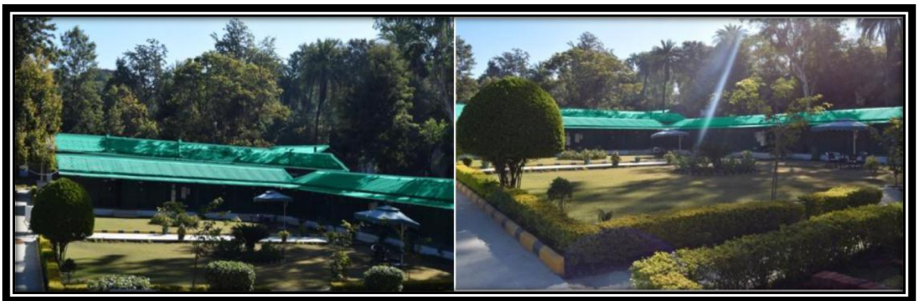
The Trainee's abode – “Participant's Hostel”

The participants will be accommodated in the Participant's Hostel. The Officers are not permitted to bring their family. However, they may do so at their own arrangement with prior approval of the Director ISA and with the condition that it will not hamper the training and its schedule. It will also not be possible to provide any type of services to those staying out of the campus. Participants are advised to strictly adhere to the proper dress code in the Officer's Mess. In case, any participant wants to stay out of the camp, in hotel etc, he can do so but entirely at his own risk and arrangements.