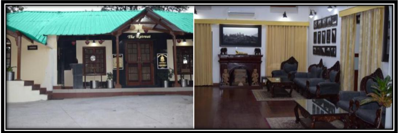
Officer's Mess-“The Retreat”

The participants will be accommodated in the Participant's Hostel. The Officers are not permitted to bring their family. However, they may do so at their own arrangement with prior approval of the Director ISA and with the condition that it will not hamper the training and its schedule. It will also not be possible to provide any type of services to those staying out of the campus. Participants are advised to strictly adhere to the proper dress code in the Officer's Mess. In case, any participant wants to stay out of the camp, in hotel etc, he can do so but entirely at his own risk and arrangements.