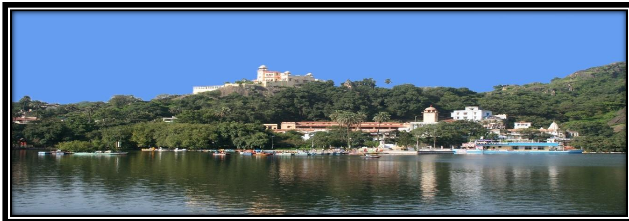
Panoramic view of Nakki lake

Aravalli range is Guru Shikhar , at 1722 meters above sea level, and is around 12 Kms from Mt. Abu. It is referred to as ' an oasis in the desert ', as its heights are home to rivers, lakes, waterfalls and evergreen forests. The ancient name of Mount Abu is " Arbudaanchal ". It is also one of the major pilgrimage sites of India for both Hindu as well as Jains. Besides the temples and sites of historical importance, Mt. Abu is also rich in natural scenic beauty.