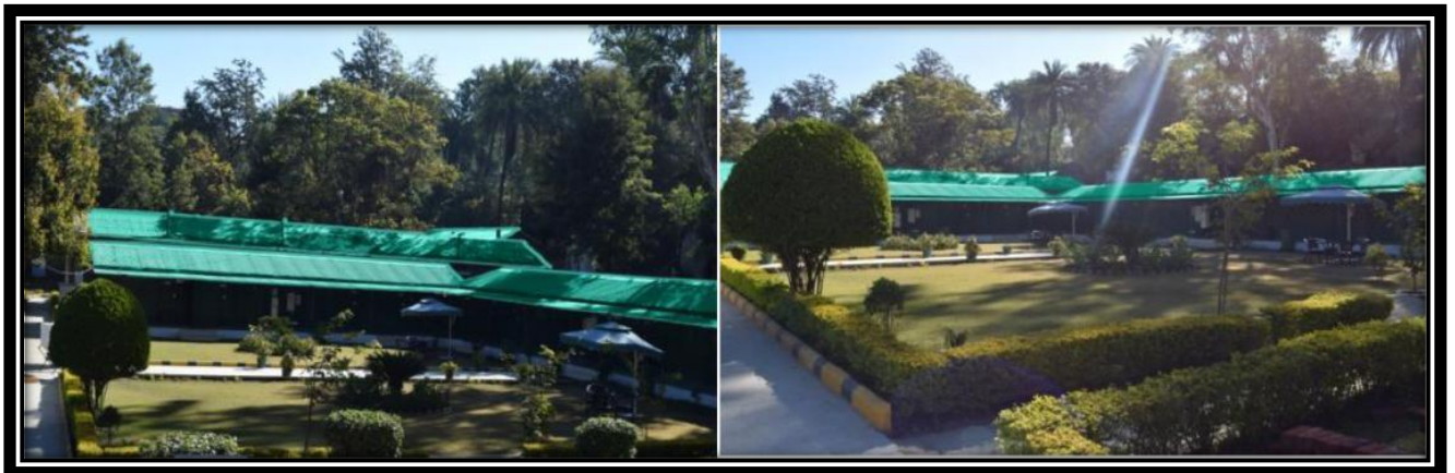
The Trainee's abode – “Participant's Hostel”

The participants will be accommodated in the Participant's Hostel. The Officers are not permitted to bring their family. However, they may do so at their own arrangement with prior approval of the Director ISA and with the condition that it will not hamper the training and its schedule. It will also not be possible to provide any type of services to those staying out of the campus. Participants are advised to strictly adhere to the proper dress code in the Officer's Mess. In case, any participant wants to stay out of the camp, in hotel etc, he can do so but entirely at his own risk and arrangements.