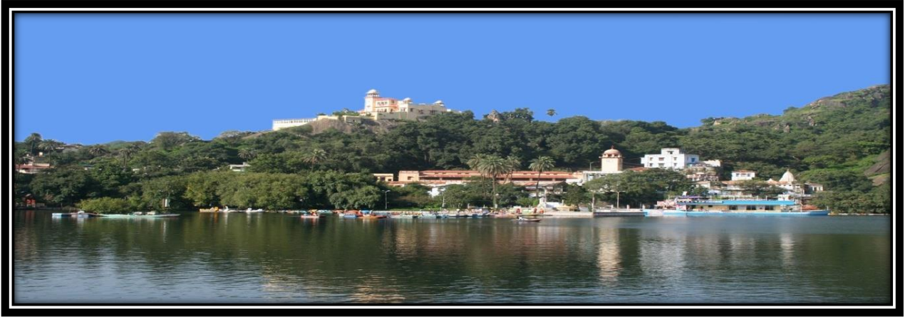
Panoramic view of Nakki - Lake

The town is located in approx 25 Sq Kms. As of 2011 India census, Mount Abu has a population of 24,982. Male constitute 58% of the population and female 42%. Mount Abu has an average literacy rate of 67%.