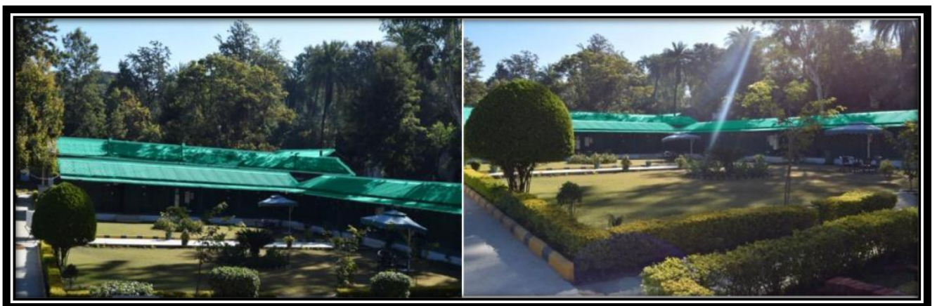
The trainee's abode – “Participant's Hostel”

The participants will be accommodated in the Participant's Hostel. The Officers are not permitted to bring their family. However, they may do so at their own arrangement with prior approval of the Director ISA and with the condition that it will not hamper the training and its schedule. It will also not be possible to provide any type of services to those staying out of the campus. Participants are advised to strictly adhere to the proper dress code in the Officer's Mess. In case, any participant wants to stay out of the camp, in hotel etc, he can do so but entirely at his own risk and arrangements.