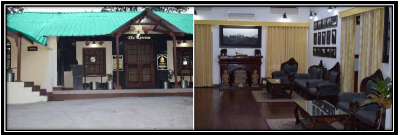
Officer's Mess-“The Retreat”

The participants will be accommodated in the Participant's Hostel. The Officers are not permitted to bring their family. However, they may do so at their own arrangement with prior approval of the Director ISA and with the condition that it will not hamper the training and its schedule. It will also not be possible to provide any type of services to those staying out of the campus. Participants are advised to strictly adhere to the proper dress code in the Officer's Mess. In case, any participant wants to stay out of the camp, in hotel etc, he can do so but entirely at his own risk and arrangements.