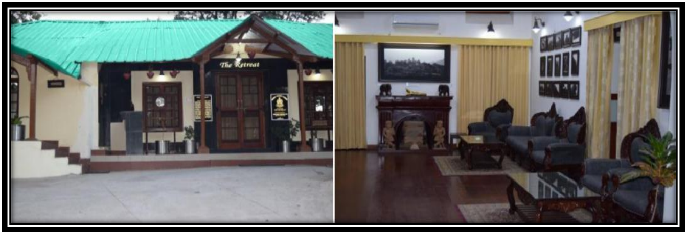
Officer's Mess-“The Retreat”

The participants will be accommodated in the Participant's Hostel. The Officers are not permitted to bring their family. However, they may do so at their own arrangement with prior approval of the Director ISA and with the condition that it will not hamper the training and its schedule. It will also not be possible to provide any type of services to those staying out of the campus. Participants are advised to strictly adhere to the proper dress code in the Officer's Mess. In case, any participant wants to stay out of the camp, in hotel etc, he can do so but entirely at his own risk and arrangements.