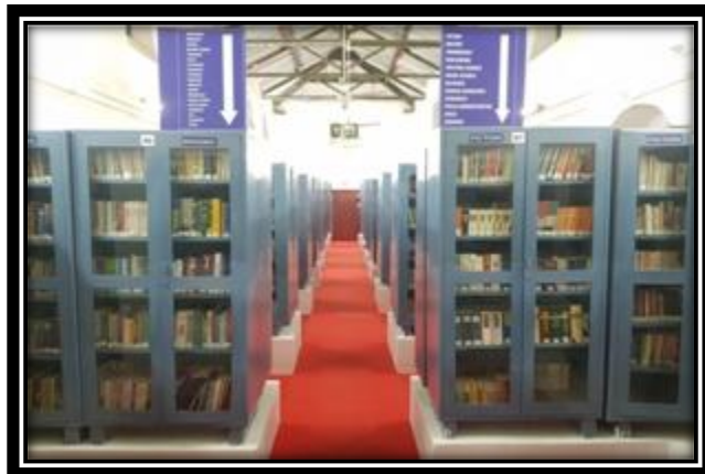
Knowledge Bank – “The library”