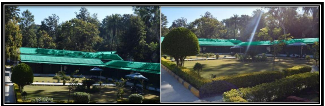
The trainee's abode – “Participant's Hostel”

The participants will be accommodated in the Participant's Hostel. The Officers are not permitted to bring their family. However, they may do so at their own arrangement with prior approval of the Director ISA and with the condition that it will not hamper the training and its schedule. It will also not be possible to provide any type of services to those staying out of the campus. Participants are advised to strictly adhere to the proper dress code in the Officer's Mess. In case, any participant wants to stay out of the camp, in hotel etc, he can do so but entirely at his own risk and arrangements.