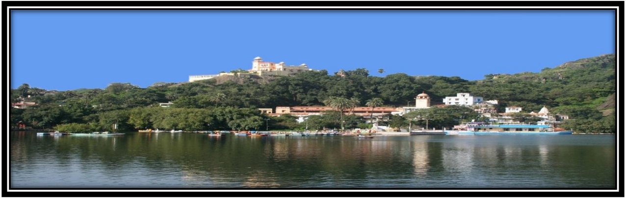
Panoramic view of Nakki-lake

The town is located in approx 25 Sq Kms. As of 2011 India census, Mount Abu has a population of 24,982. Male constitute 58% of the population and female 42%. Mount Abu has an average literacy rate of 67%.