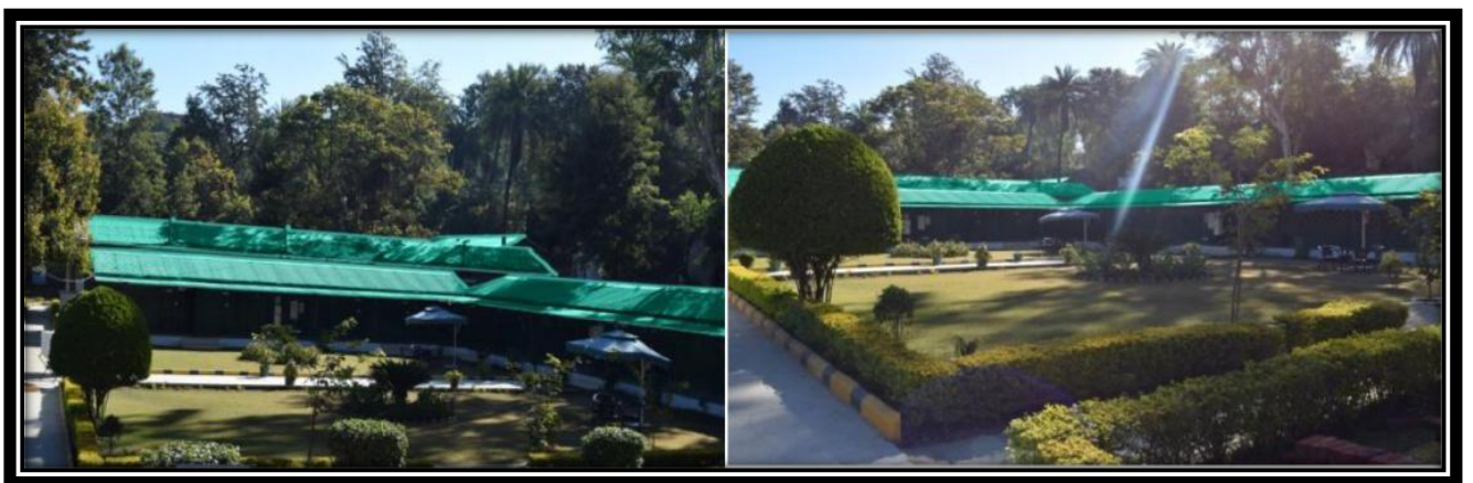
The trainee's abode – “Participant's Hostel”

The participants will be accommodated in the Participant's Hostel. The Officers are not permitted to bring their family. However, they may do so at their own arrangement with prior approval of the Director ISA and with the condition that it will not hamper the training and its schedule. It will also not be possible to provide any type of services to those staying out of the campus. Participants are advised to strictly adhere to the proper dress code in the Officer's Mess. In case, any participant wants to stay out of the camp, in hotel etc, he can do so but entirely at his own risk and arrangements.