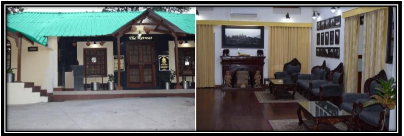
Officer's Mess-“The Retreat”

The participants will be accommodated in the Participant's Hostel. The Officers are not permitted to bring their family. However, they may do so at their own arrangement with prior approval of the Director ISA and with the condition that it will not hamper the training and its schedule. It will also not be possible to provide any type of services to those staying out of the campus. Participants are advised to strictly adhere to the proper dress code in the Officer's Mess. In case, any participant wants to stay out of the camp, in hotel etc, he can do so but entirely at his own risk and arrangements.