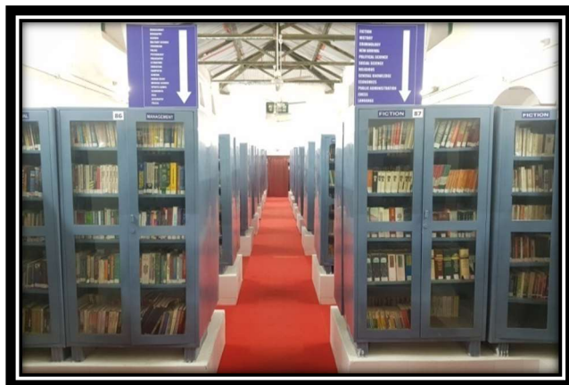
Knowledge Bank – “The library”