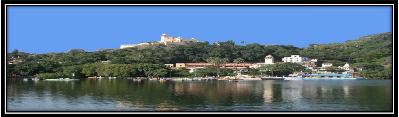
Panoramic view of Nakki-lake

as well as Jain religions. Besides the temples and sites of historical importance, Mt. Abu is also rich in natural scenic beauty.