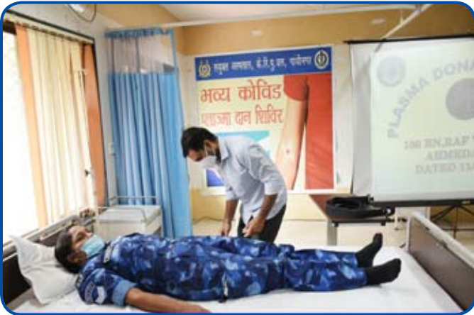
▲ 100 बटालियन द्वारा प्लाज्मा डोनेशन कैंप का आयोजन।