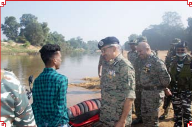
महानिदेशक, केरिपुबल, स्थानीय लोगों से बातचीत करते हुए।