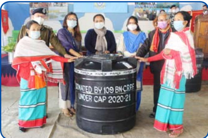
▲ सिविक एक्शन प्रोग्राम के दौरान 109 बटालियन द्वारा ग्रामीणों को वाटर टैंक का वितरण।