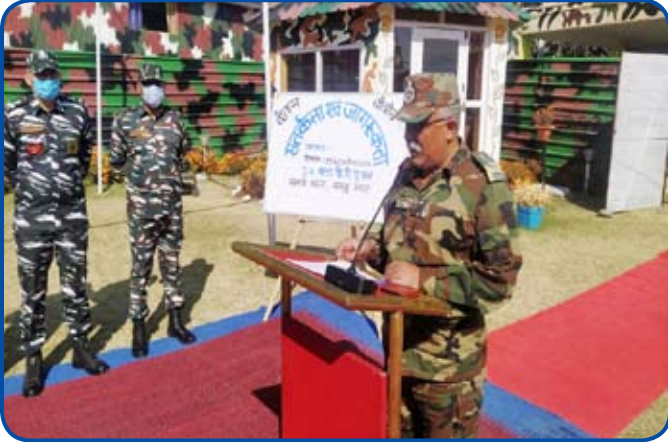
▲ 24 बटालियन के अधिकारी एवं कार्मिक सर्तकता जागरूकता सप्ताह के दौरान।