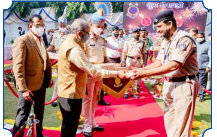
महानिदेशक केरिपुबल, दीपावली के अवसर पर जवानों को मिष्ठान वितरण करते हुए।