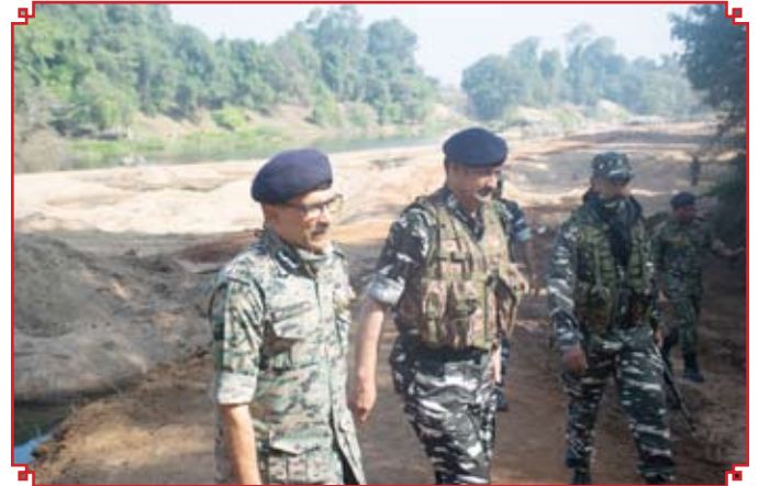
महानिदेशक, केरिपुबल, भ्रमण के दौरान अधिकारियों से बातचीत करते हुए।