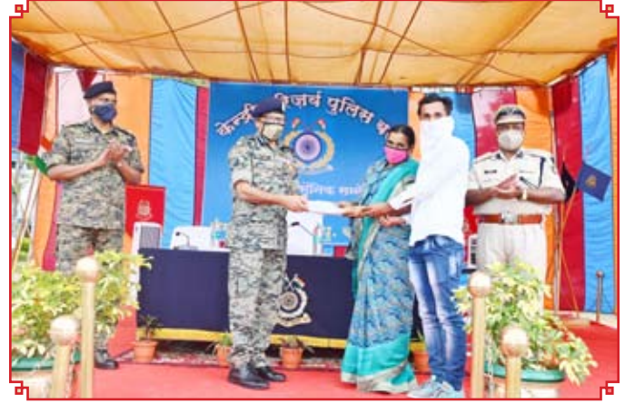
महानिदेशक, केरिपुबल, सैनिक सम्मेलन के दौरान शहीद परिवार के सदस्यों से भेंट एवं सम्मानित करते हुए।