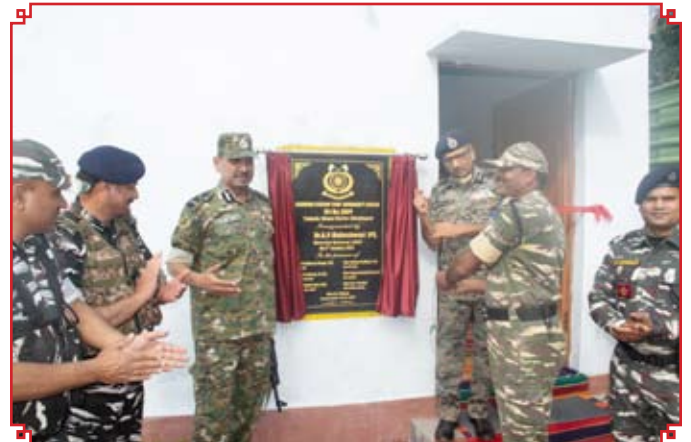
महानिदेशक, केरिपुबल, लर्निंग स्टेशन कम कम्युनिटी सेंटर का उद्घाटन करते हुए।