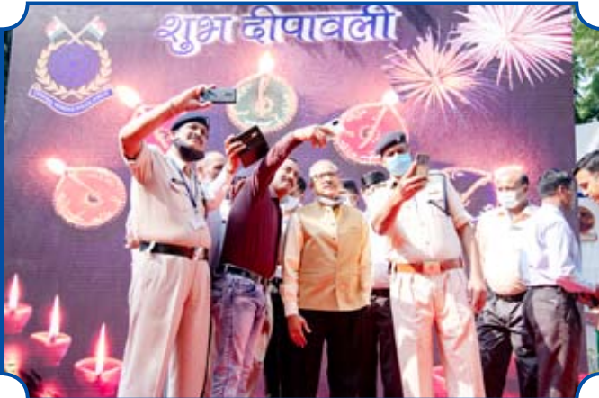
महानिदेशक, केरिपुबल, दीपावली मिलन समारोह के दौरान कार्मिकों के साथ।