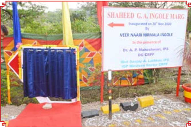
महानिदेशक, केरिपुबल, ग्रुप केन्द्र, केरिपुबल, पुणे में शहीद जी.ए. इंगोले मार्ग एवं शहीद रविन्द्र धनवाड़े, फलोद्यान का उद्घाटन करते हुए।