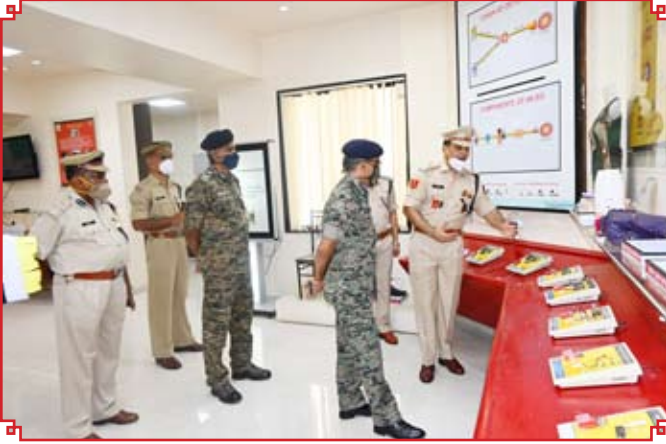
महानिदेशक, के.रि.पु.बल का आई.ई.डी. स्कूल पुणे में भ्रमण।