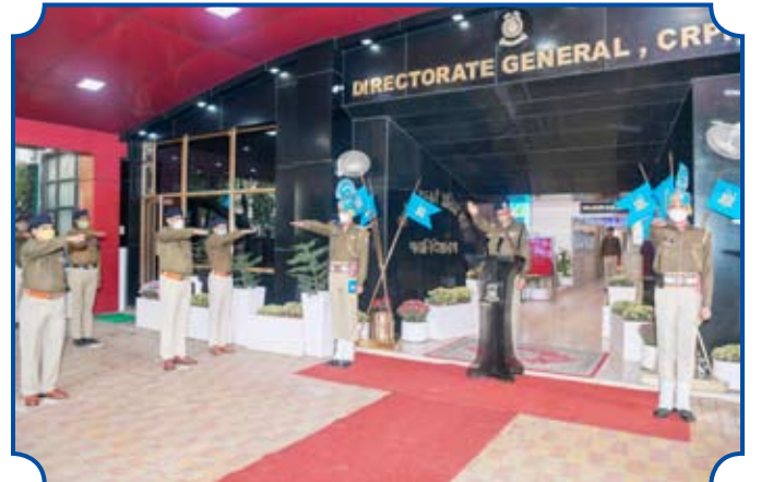
महानिदेशालय के अधिकारी एवं कार्मिक दिनांक 01 दिसम्बर 2020 को संविधान दिवस शपथ के दौरान।