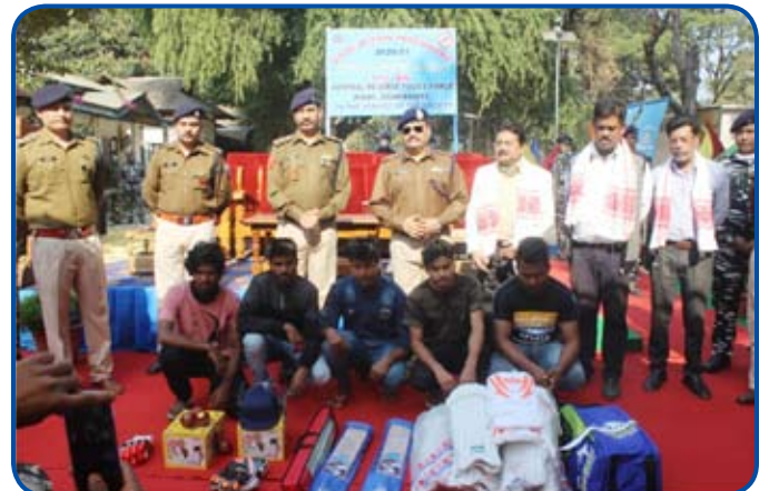
▲ सिविक एक्शन प्रोग्राम के तहत 175 बटालियन, केरिपुबल द्वारा ग्रामीणों को क्रिकेट किट का वितरण।