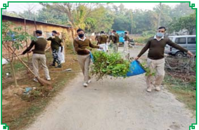
▲ स्वच्छता अभियान के दौरान 108 आर.ए.एफ के अधिकारी एवं जवान।