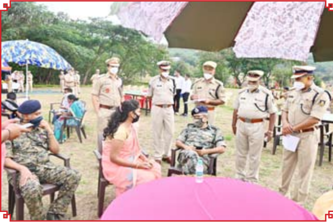
महानिदेशक, केरिपुबल, सैनिक सम्मेलन के उपरान्त उपस्थित शहीद परिवार सदस्या से वार्तालाप एवं उनकी समस्याओं पर विचार कर संबंधित अधिकारियों को निर्देश देते हुए।