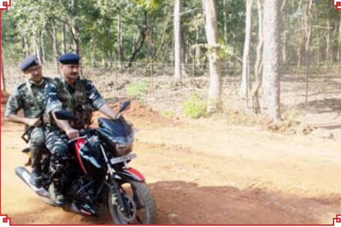
महानिदेशक, केरिपुबल, 151 बटालियन के क्षेत्राधिकार का भ्रमण करते हुए।