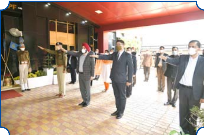
महानिदेशालय के अधिकारी एवं कार्मिक दिनांक 26 नवम्बर 2020 को संविधान दिवस शपथ के दौरान।