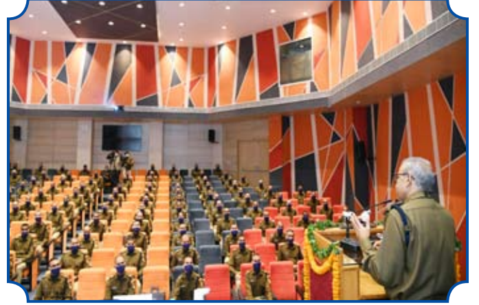
महानिदेशक, केरिपुबल, दिनांक 17/11/2020 को विजन 2022 पुस्तक विमोचन के दौरान केरिपुबल अकादमी में प्रशिक्षु अधिकारियों को संबोधित करते हुए।