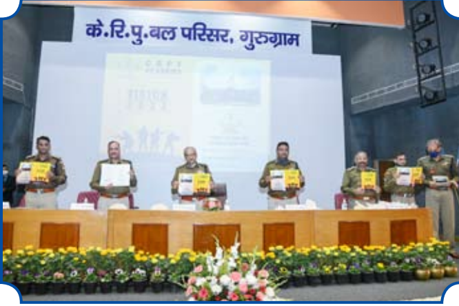
महानिदेशक, केरिपुबल, केरिपुबल, अकादमी, गुरुग्राम में दिनांक 17/11/2020 को विजन 2022 पुस्तक का विमोचन करते हुए।