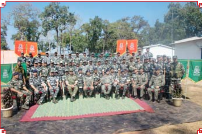
महानिदेशक एवं 151 बटालियन के अधिकारी/कार्मिक सामूहिक फोटो सेशन के दौरान।