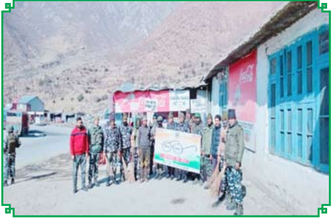
▲ स्वच्छता पखवाडा के दौरान 24 बटालियन के अधिकारी एवं जवान।