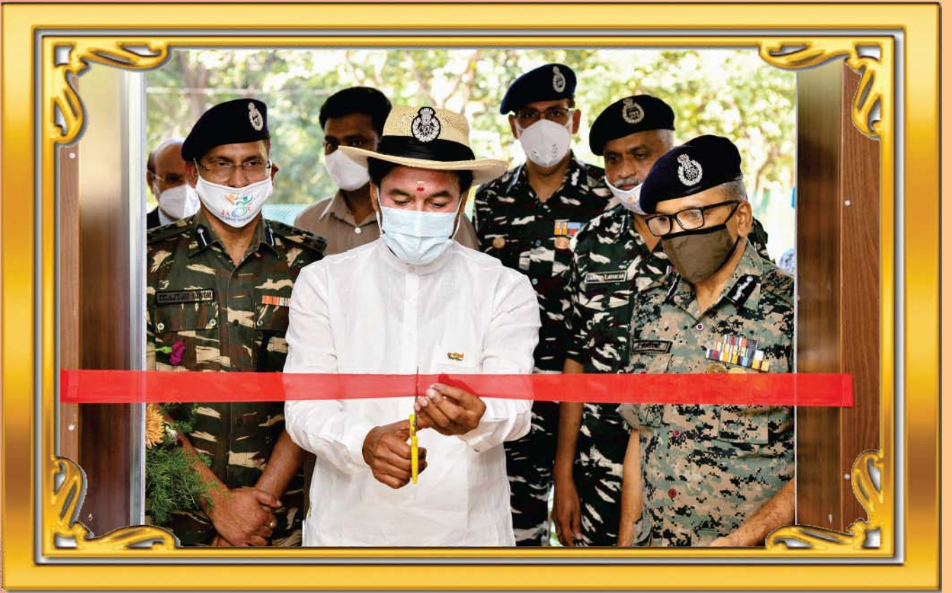
श्री जी० किशन रेड्डी, केन्द्रीय गृह राज्यमंत्री के द्वारा ग्रुप केन्द्र, केरिपुबल, रंगारेड्डी स्थित नवनिर्मित NCDE संस्थान का उद्घाटन।