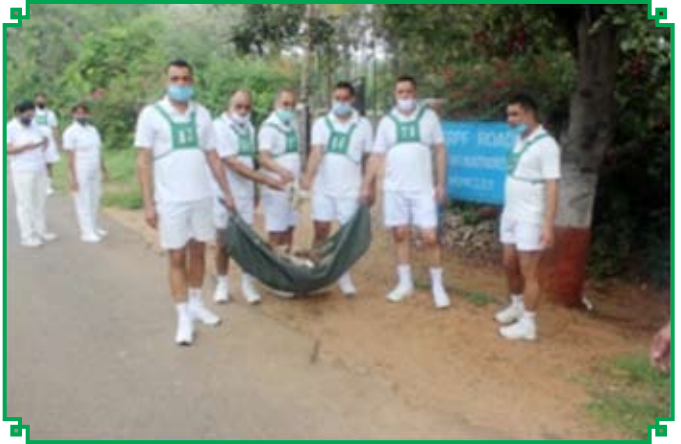
▲ स्वच्छता पखवाड़े के दौरान सी.टी.सी.-2 के अधिकारी, कार्मिक एवं प्रशिक्षण प्राप्त कर रहे प्रशिक्षु।