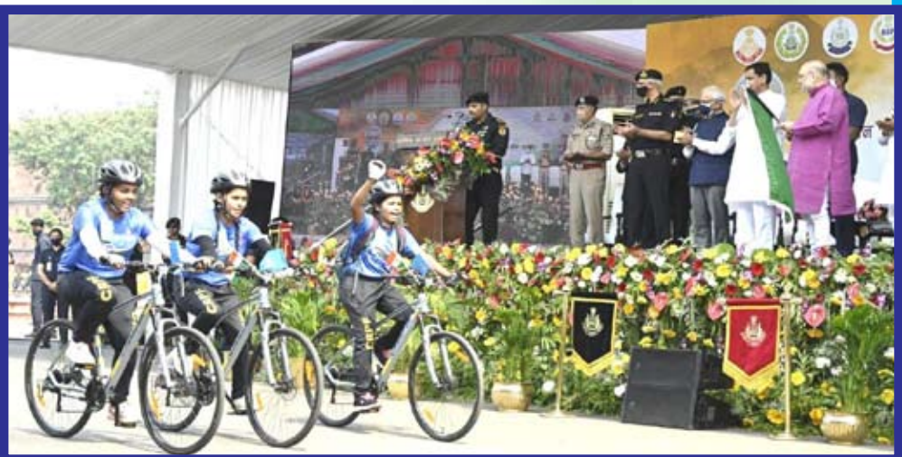
Shri Amit Shah, Minister of Home Affairs and Minister of Cooperation flagged in the Azadi ka Amrit Mahotsav Cycle Rally of CAPFs.

in. 200 Cyclists of CRPF, including 20 women personnel reached Red Fort. During the 7237 Km that these 4 CRPF Cycle Rallies had covered to reach Red Fort, they visited historically significant places related to freedom struggle enroute, cherishing the great sacrifices made by our freedom fighters and apprising people about historic celebrations of Azadi Ka Amrit Mahotsav.