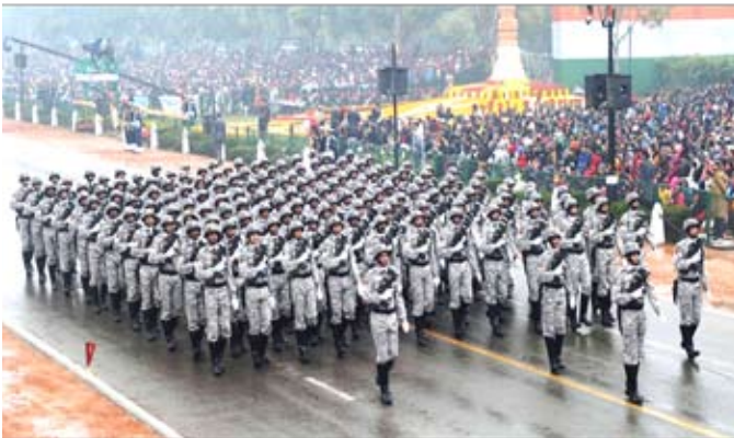
Stealth Killers of Jungle - The CoBRA Contingent on Rajpath

In recognition of the yeoman service in the field of maintaining Internal Security of the country, the Force has the honour of earning Presidential Colour as early as 19 March 1950 along with 1980 gallantry medals, 2969 distinguished & meritorious service medals, so far.