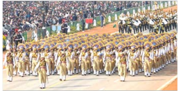
CRPF Contingent on the Rajpath

amplification in the charter of duties & quantum of deployment, the Force has grown to the present size of over 246 units, with the honour of being the largest para-military force in the world, with modern weapons, equipment & accessories including UAVs and high-speed communication network connecting all static establishments.