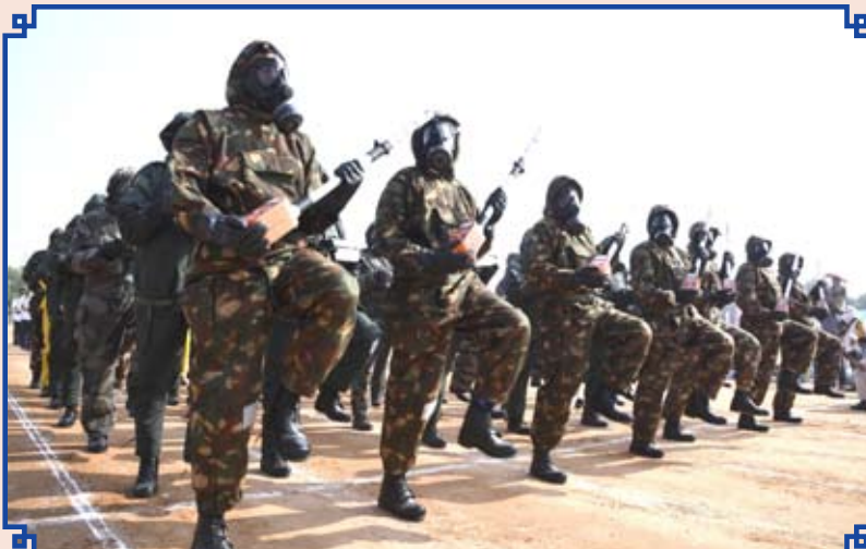
Disaster Management teams marching during 29 th RAF Anniversary.