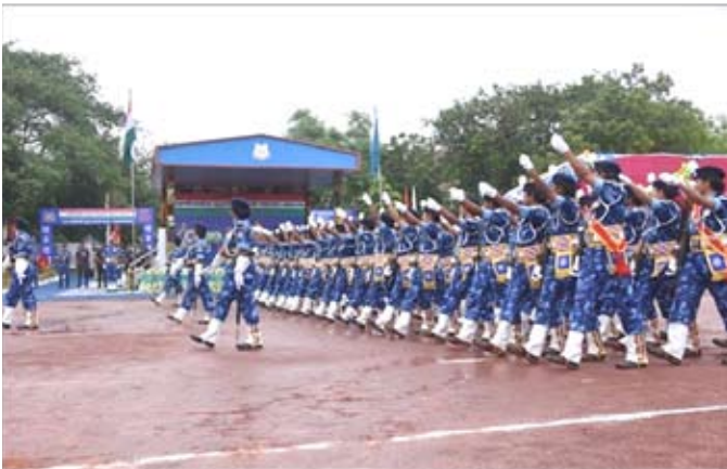
CRPF Rapid Action Force Contingent Marching Past the Saluting Base

The expansion being demand based, didn't go in vain, the force continued with sustained deployment of above ninety percent of the strength, telling upon the periodic rotational refresher & re-fitment training of the Force (reflected in sporadic; high operational casualties, fratricides & suicides). Continuously high degree of deployment, though, gave the men & officers of the force a high degree of operational confidence, albeit at an avoidable high cost of men & material. To overcome such reverses, eight percent of men in twelve batches of one month refresher training, (complying with the National Training Policy which lays down that 10% of the total service duration of every Govt servant should be devoted to training, and, sixteen percent of men (in six batches of) two months annual leave, total twenty-four percent of numerical strength (not formations) should be unavailable for duties at all times of a calendar year - to be accepted as maintenance cost of a well-trained & efficient force with high moral. It needs no emphasis that the moment the prohibited line of seventy-six percent deployment is crossed, a rise in attrition, incidents of fratricides & suicides should always be feared.