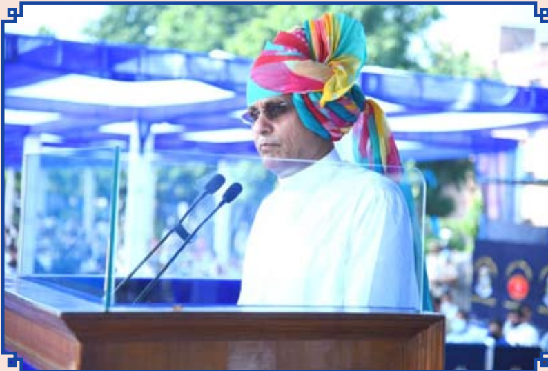
Shri Nityanand Rai, Minister of State for Home Affairs addressing the audience during 29 th RAF Anniversary parade.

The novel addition to this year’s parade were the tableaux depicting the newly inducted teams which will respond in case of natural and man made disasters, specially CBRN