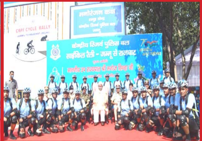
Hon'ble Lieutenant Governor of J&K, Shri Manoj Sinha flagged off the Azadi ka Amrit Mahotsav CRPF Cycle Rally from Group Centre CRPF, Jammu.