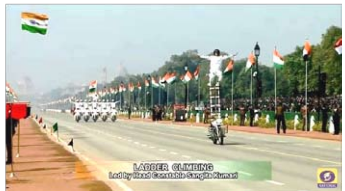
CRPF Dare Devil Women on Display of Their Professional Prowess on the Rajpath

The phase after 1984 saw a paradigm shift in the canvas of internal security in the country from a traditional law & order to a host of different manifestations of internal security - truly chronicled in the expansion of the Force, i.e. repeated incidence of riots in multi-ethnic towns of the country, giving rise to the Mahila Units (1987) & Rapid Action Force (1992); intense militancy in Punjab & J&K, honing up the professional competence of the officers & men of the Force; spread of new version of Left Wing Extremism with improved indoctrination, weaponry & tactics, in north-eastern Andhra, Chhattisgarh & a few districts of Odisha, giving rise to Commando Battalions for Resolute Action - CoBRA (2008)-trained to function in dense forests as the LWE cadres did; attack on PM (of 1984) & Parliament (Dec 2001), gave rise to Special Duty Group & Parliament Duty Groups - with high fitness & accurate handling of modern covert weapons; while a large part of the Force carried on fighting the resurgent insurgency in North-Eastern states of upper Assam, Nagaland, hilly Districts of Manipur & Tripura (Mizo insurgency since ended with Mizo accord during mid-eighties), now a new wing of Force specially earmarked, trained & deployed for VIP security. Thankfully the specialized & branched expansion of the Force was accompanied by the raising of commensurate specific training establishment and acquisition of job specific equipment, accessories & transport.