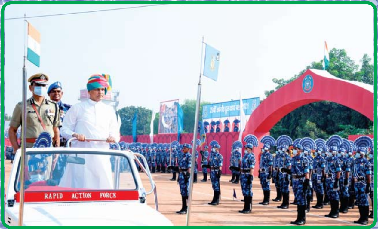
श्री नित्यानन्द राय, केन्द्रीय गृह राज्यमंत्री, द्रुत कार्य बल की 29वीं वर्षगाँठ पर परेड का निरीक्षण करते हुए।