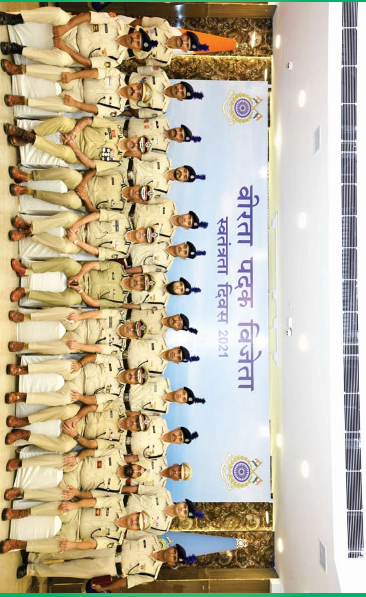
महानिदेशक के.रि.पु.बल एवं वरिष्ठ अधिकारीगण, स्वतंत्रता दिवस 2021 के अवसर पर पदक विजेताओं के साथ।