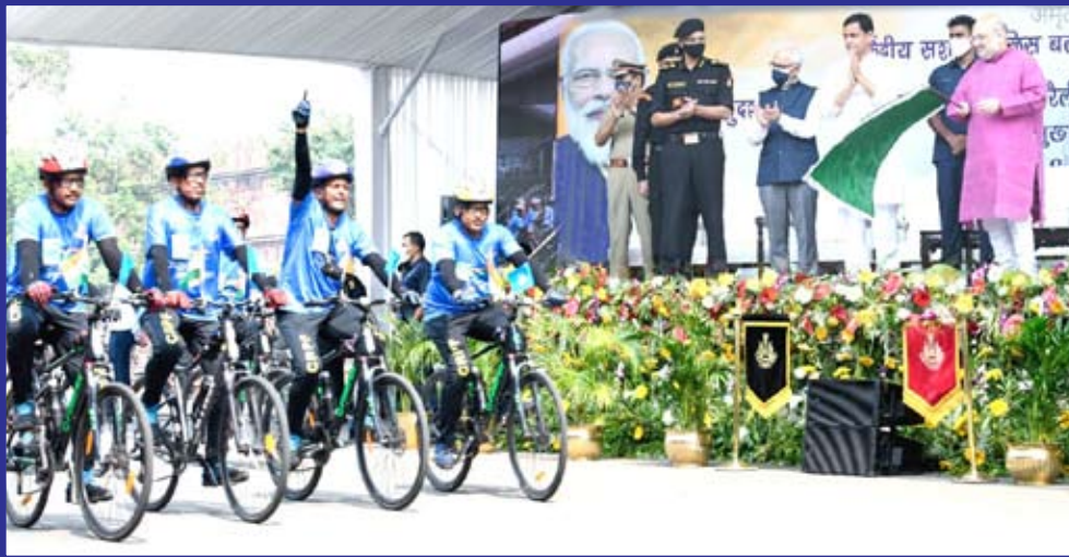
Shri Amit Shah, Minister of Home Affairs and Minister of Cooperation flagged in the Azadi ka Amrit Mahotsav Cycle Rally of CAPFs.

In a spectacular ceremony held at the iconic Red Fort, the Union Minister of Home Affairs and Minister of Cooperation, Shri Amit Shah flagged in the Azadi ka Amrit Mahotsav Cycle Rallies of all the Central Armed Police Forces which emanated from different parts of the country and had pedaled thousands of kilometers to reach the National Capital on 02/10/2021.