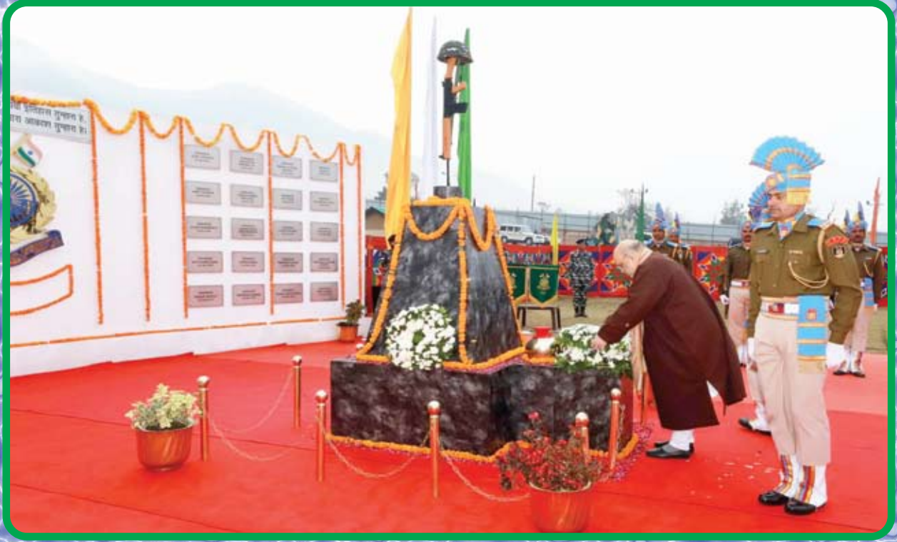
श्री अमित शाह, केन्द्रीय गृहमंत्री एवं सहकारिता मंत्री पुलवामा शहीद स्मारक, लेथपोरा पर श्रद्धांजलि अर्पित करते हुए।