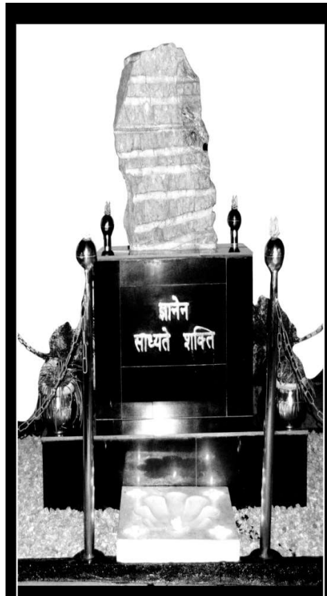
Centre of Excellence

After the First World War (1914 – 1918) East India Company took care of education of the wards of old boys of Abu Lawrence School who died during the war. On 15 th September, 1948 a training college for Indian Police Service Officers was set up at Mount Abu. Initially, the college was housed in Army Barracks. Abu Lawrence School was closed on 30 th December 1950. The premises of the school building were acquired for housing its offices, class rooms, library and Rajputana Hotel Estate for its officer’s mess. After the shifting of Central Police Training College in its rechristened version as SVP National Police Academy to Hyderabad, the Central Reserve Police Force took over the complex to establish the Internal Security Academy on 1 st February 1975.