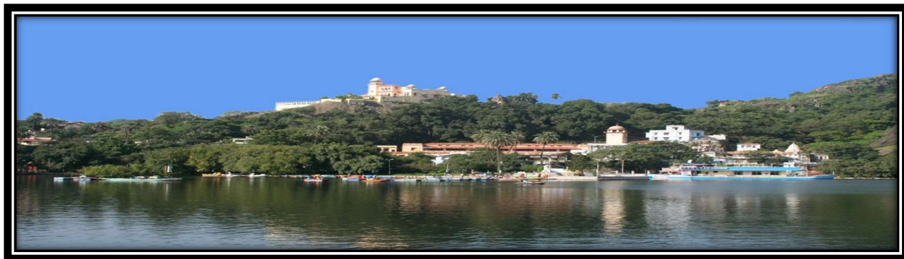
Panoramic view of Nakki

The town is located in approx. 25 Sq.km. As per 2011 India census, Mount Abu had a population of 24,982. Males constitute 58% of the population and females 42%. Mount Abu has an average literacy rate of 67%.