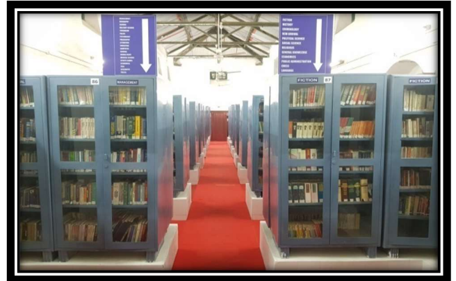
Knowledge Bank – “The library”