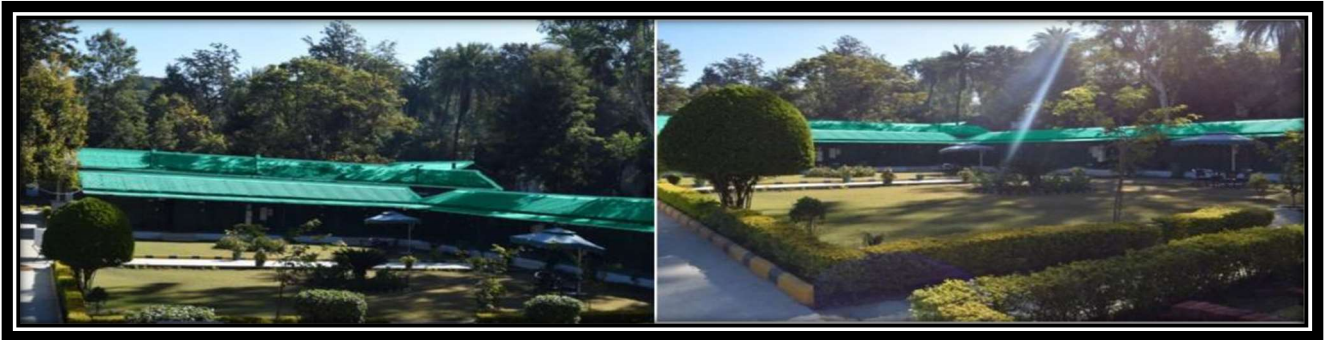
The trainee's abode – "Participants Officers' Hostel"

The Participants will be accommodated in the Participant's Hostel/RHE, as the case may be. Participants are advised to strictly adhere to the appropriate dress code in the Officers' Mess. No Participant will be permitted to stay out of the camp, in hotels etc. without prior approval.