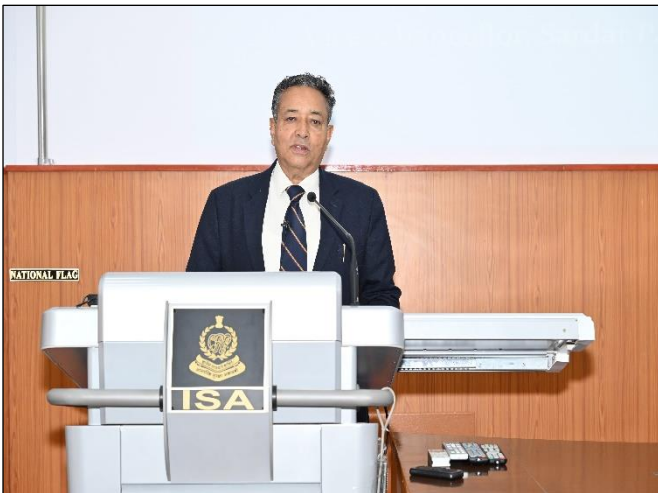
Shri M L Kumawat, DG (Retd), BSF, taking session on "The Concept of Internal Security ."