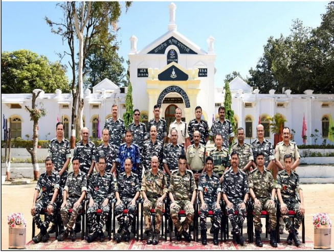
Group photograph of Participant Officers.