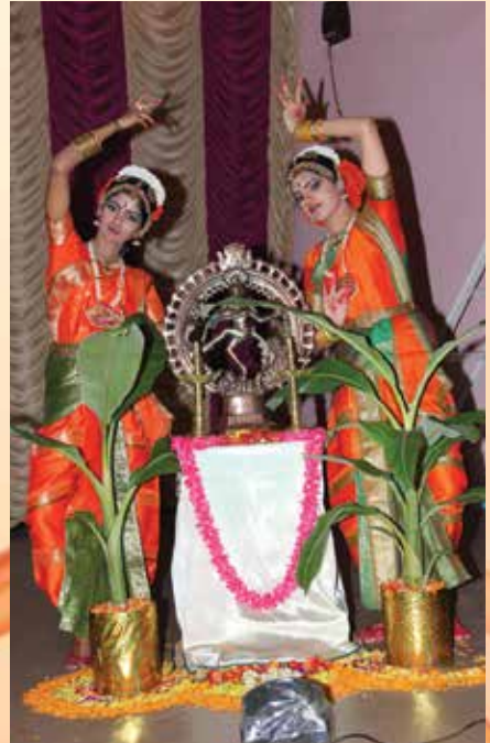
Women's Day – Cultural Programme