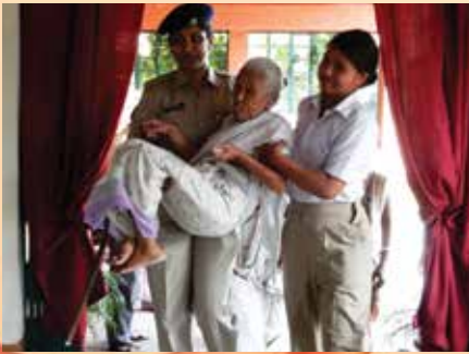
World Senior Citizen Day