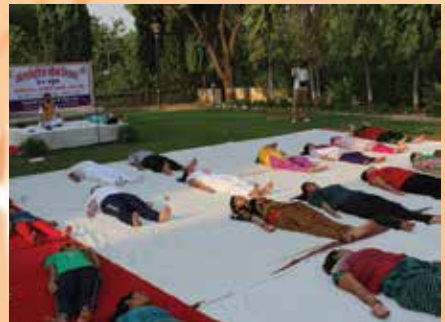
From being extrovert to introvert : Mahilas performing dance at CWA Raising Day ( left) and performing asanas during International Day of Yoga (Right)