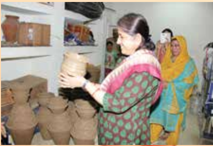
President CWA Visit to Pottery at SS Headquarter, Hyderabad