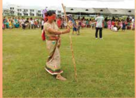
CWA Raising Day Celebration