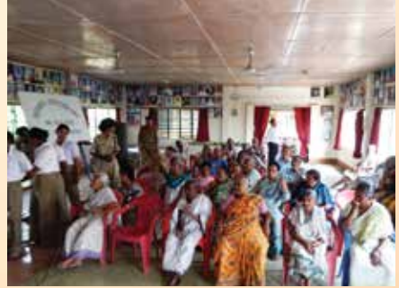
World Senior Citizen Day