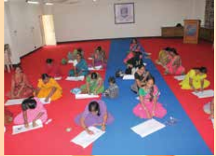
Women's Day – Painting Competition