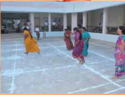
Women's Day – Kabaddi Competition