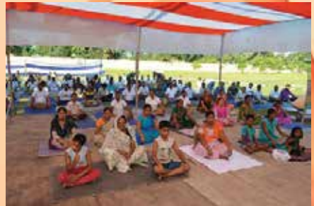
International Day of Yoga