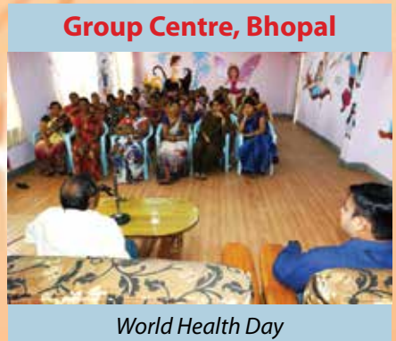
World Health Day