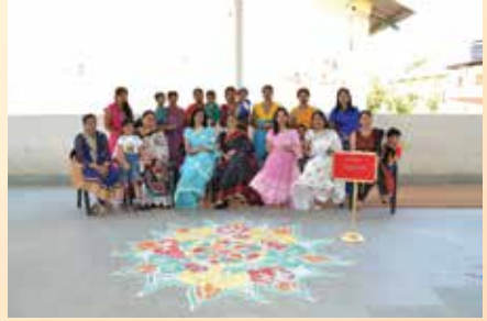
A riot of colours: Mehandi competition (left) & Rangoli competition (Right)