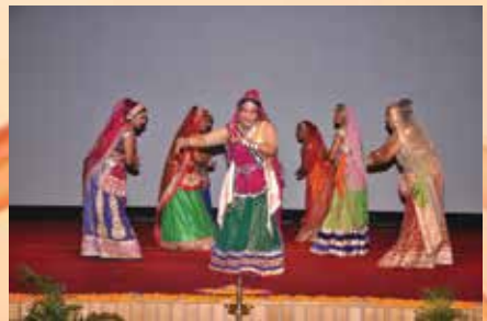
Expression of Joy: Members and schoolchildren show off their skills during CWA Raising Day