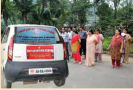
Driving course for Mahilas