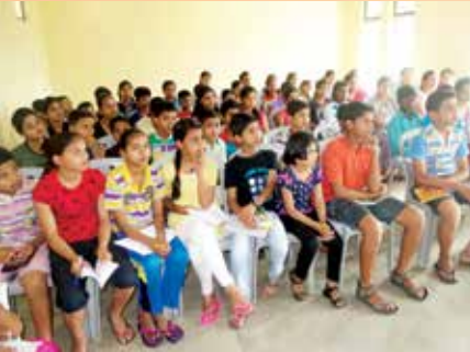
English Speaking Course for children