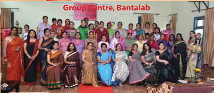
Members of Regional CWA Bantalab, Jammu