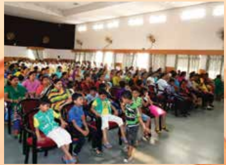
International Family Day