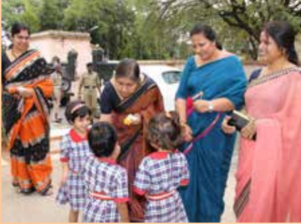
Visit of President CWA to Montessori School