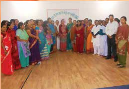
International Family Day