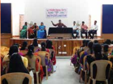
World Health Day