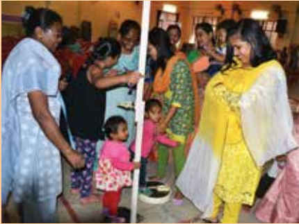
International Health Day