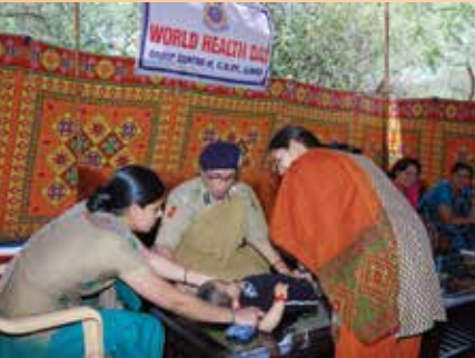
Ensuring Health of future citizens: World Health Day