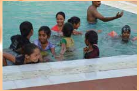
Music & Swimming classes for the children at 107 RAF