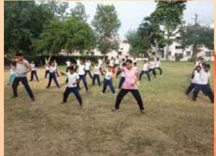
Self Defence Course