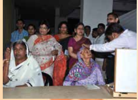
President CWA visited the Dett hospital of Northern Sector and met patients there (left) and also attended an Eye Check Up camp for the elderly