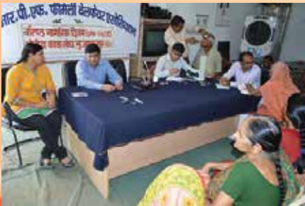
Senior Citizen Day