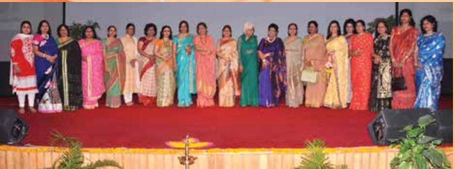
CWA members pose with President CWA