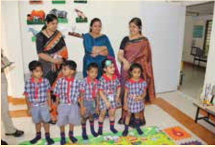
President CWA Visit Mont School, Hyderabad