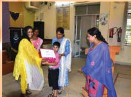
World Health Day