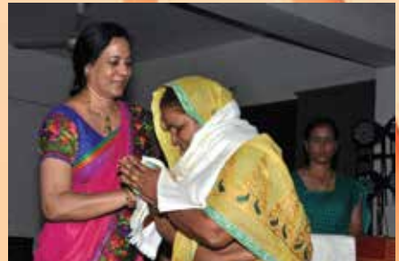
Senior Citizens' Day