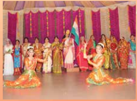
Women's Day – Cultural Programme