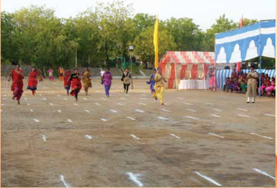
International Family Day – 100 Mtr Running Competition for ladies