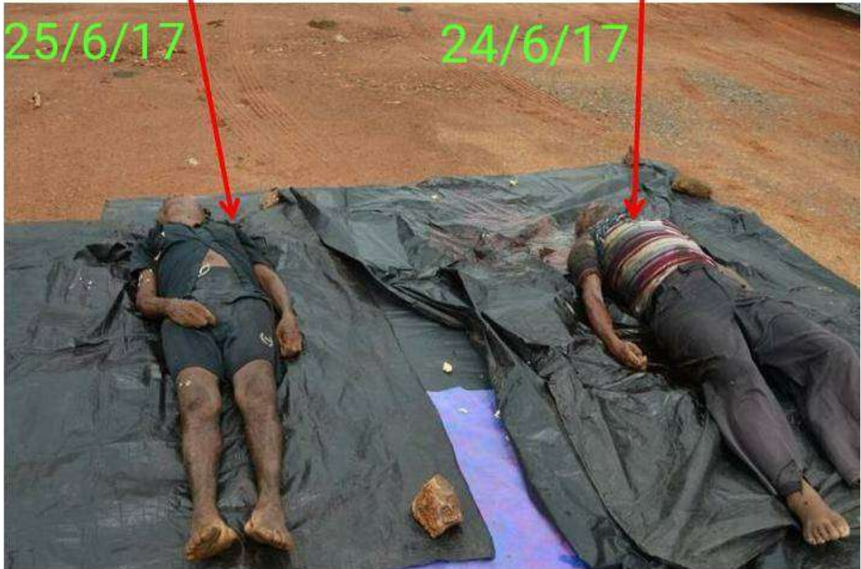
NA XAL KILLED AT PID I Y A