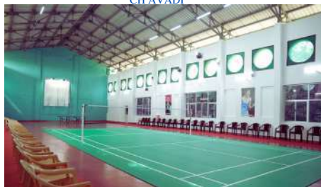
INDOOR BADMINTON COURTS