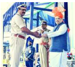
POLICE MEDAL FROM HON'BLE HM