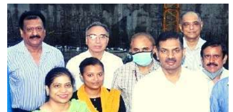
AT CRPF HQ SITE WITH DG CRPF