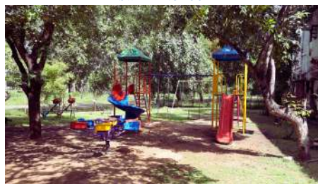
CHILDRENS PLAY AREA