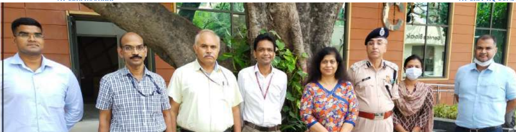
AT DEFENCE BUILDINGS BIKAJI KAMA PLACE