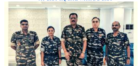
On Superannuation day