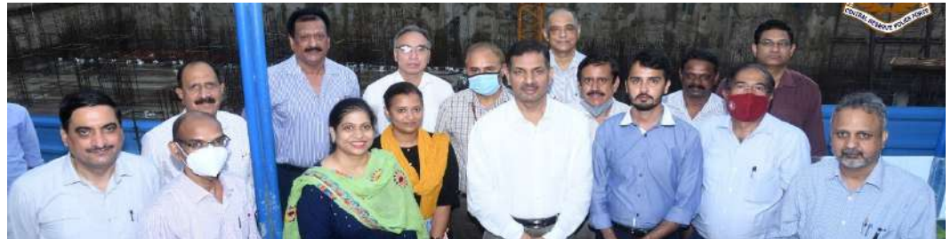
AT CRPF HQ CONSTRUCTION SITE WITH DG CRPF