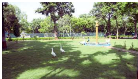
OFFICE FRONT GREEN AREA