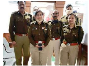
FIRST ARRIVAL IN WORKS DTE