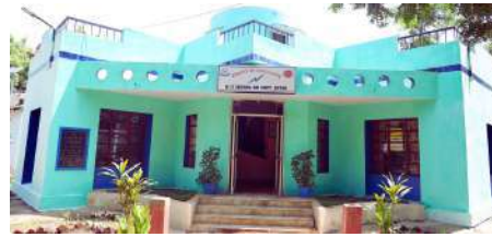
D/2 SIGNAL BN