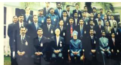
WITH SHRI. MANMOHAN SINGH (PM) IN SPG