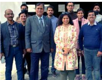
AT CBRI ROORKHI