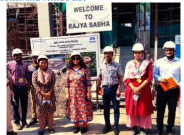
AT NEW PARLIMENT SITE