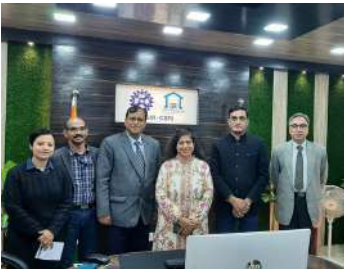
AT CBRI ROORKHI