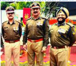
REPUBLIC DAY AT CGO