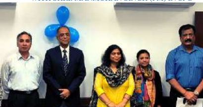
AT WORKS CONFERENCE