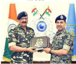
Momento by DG CRPF