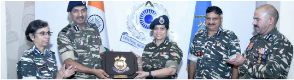
FAREWELL AT CGO

She has undergone various courses on subjects that encompass almost all the aspects of policing -Bank Frauds, Community Policing, Cyber and Internet Crimes, Good Governance and Role of Police, Direct Trainers Skill, Role of Technology in Crime and Crime Prevention, to name a few. During, 2015, she attended the MCTP Phase-IV mandatory training programme including Foreign Component at Cambridge University, UK. She participated in the United Nations Senior Mission Leaders' Course held at Accra,