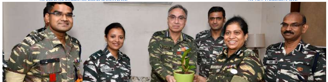
FAREWELL WORKS DTE.