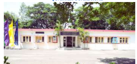
OFFICE OF DIGP