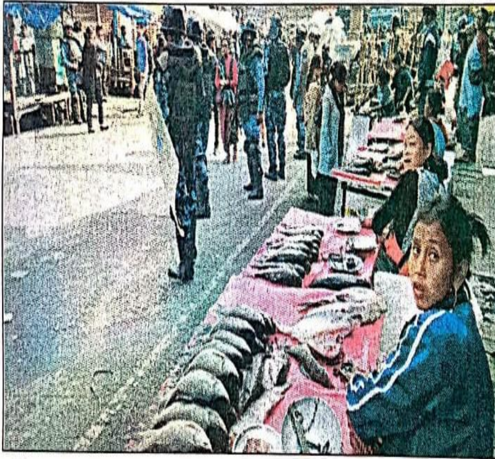
The Iewduh area in Shillong on Thursday. (UB)

TAFF CORRESPONDENT where one person was back to normalcy. The In- HILLONG, March 5: stabbed by unidentified ternet was also restored on arranging a stray incident area, Shillong is limping Thursday afternoon. The incident at