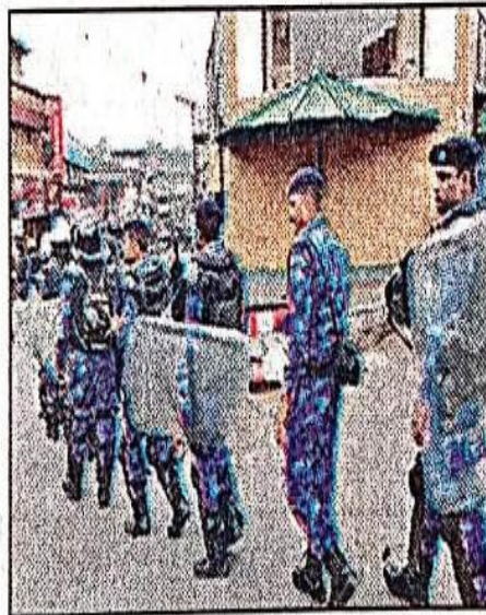
Rapid Action Force patrol the streets of Shillong on Thursday

An Assam government official said, "They (migrant workers) didn't get food for the last five to six days because of the curfew in Meghalaya and were scared to come out." Most of these people, including women,