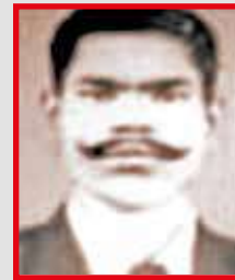
SHAHEED CT K. SANKARAN