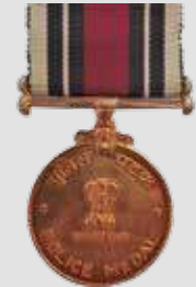
SHAHEED CT K.G. HINGOLE