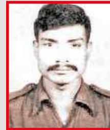
SHAHEED CT DHARNIDHAR NATH