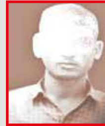
SHAHEED CT KANWAR SINGH