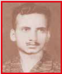
SHAHEED CT SHAMSHER SINGH