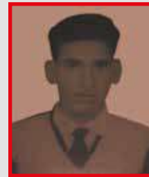
SHAHEED CT SHANKAR DUTT