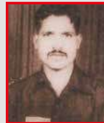
SHAHEED CT PURAN BALLABH