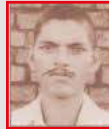
SHAHEED CT BRAHMESHWAR SINGH