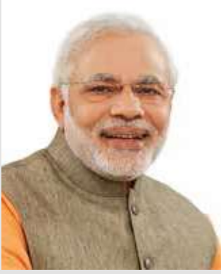
नरेन्द्र मोदी NARENDRA MODI