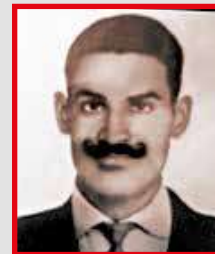
SHAHEED CT JABAR SINGH

Shaheed Ct Jabar Singh was posted in 45 Bn, deployed in Andhra Pradesh to contain the activities of naxalites and to maintain law and order in the state. In a case of firing in the intervening night of 18-19 August 1973, he sustained grievous injuries and later succumbed to his death making supreme sacrifice in the line of duty.