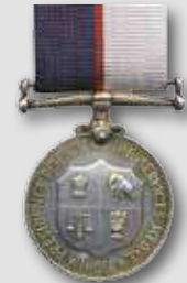
SHAHEED CT BALDEV SINGH