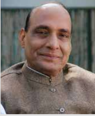
राजनाथ सिंह RAJNATH SINGH