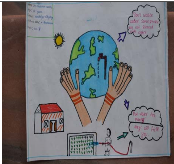
1 st Prize