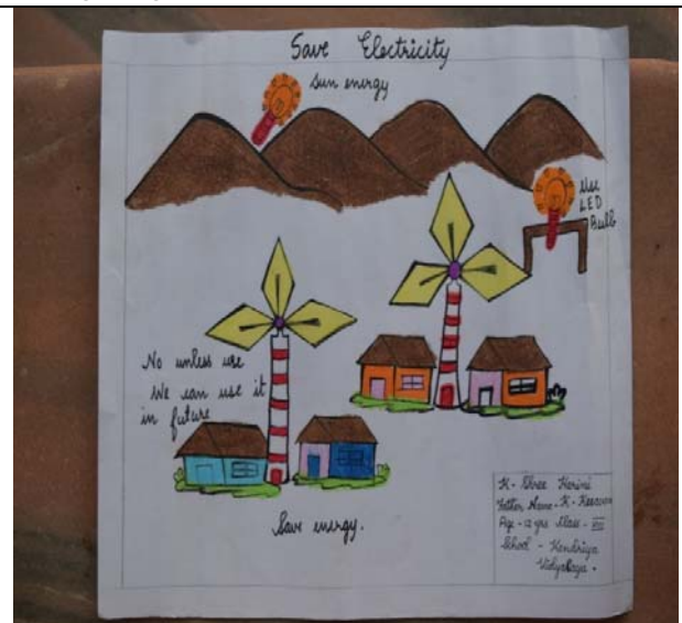
2 nd Prize