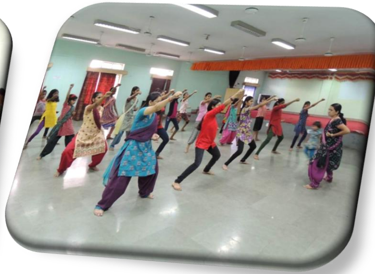
परिवार कल्याण केन्द्र में महिलाओं द्वारा जूडो कराटे प्रशिक्षण