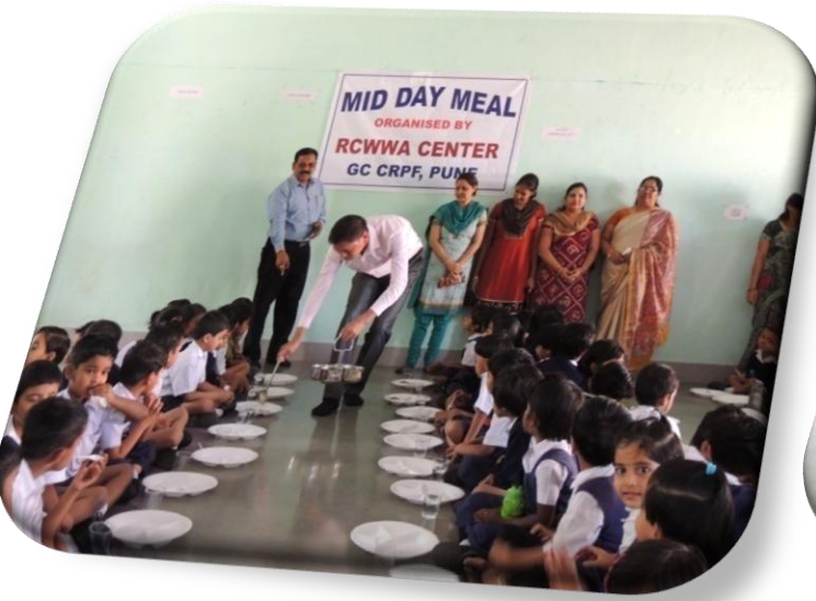
मोन्टेसरी स्कूल में मिड डे मिल का आयोजन

महिला दिवस के अवसर पर कई मनोरंजक कार्यक्रमों का आयोजन किया गया। महिलाओं के मनोबल को उँचा बनाना, उनके मनोरंजन हेतु परिवार कल्याण केन्द्र में तीज त्योहारों के अवसर पर झूले लगाना, म्यूजिकल चेयर प्रतियोगिता, मेहंदी एवं रंगोली जैसी विविध प्रतियोगिताओं का आयोजन बड़े ही रंगारंग तरीके से करवाना शामिल होता है।